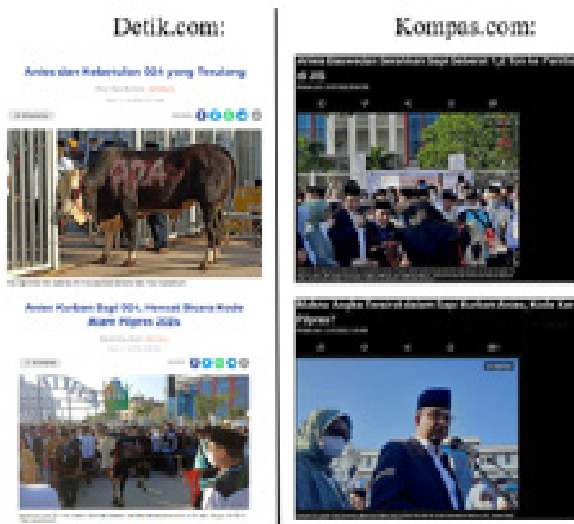
Figure 4 Difference between Detik.com and Kompas.com image framing

journalists connected with many sources. However, Detik.com prefers people who have connections or people closest to Anies, such as Anies loyalists, deputy governor Anies, and two figures from political observers. Meanwhile, Kompas.com only involved one resource person, namely a political observer.