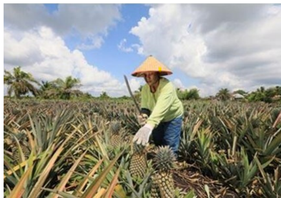
Figure 2. Pineapple plantation on fertile peat land

Apit District is located approximately 202 km from the provincial capital and approximately 60 km from the capital of Siak Regency, with an area of 386.14 km 2 . The natural capital of Sungai Apit Regency is very rich and diverse, with significant agricultural land, forests, wetlands, and water resources that support the local economy and the livelihoods of its residents. However, the district faces challenges related to deforestation, land degradation, climate change, and sustainable resource management. Protecting and conserving natural capital through sustainable agricultural practices, forest conservation, wetland preservation and improved water management will be critical to the future of Sungai Apit and its ability to continue to support its people in the long term. Efforts to balance economic development with environmental management will be key to ensuring the district's natural resources are available for future generations.