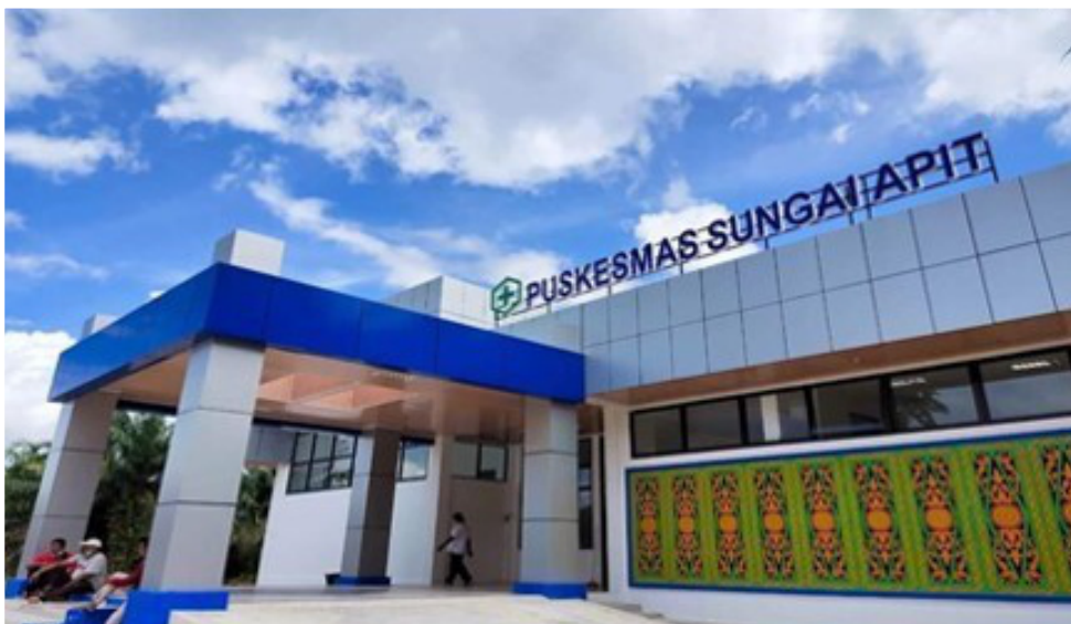
Figure 6. The presence of a Puskesmas indicates the availability of good health services

Beyond its direct function, health infrastructure plays a strategic role in shaping overall community development. Limited access to quality healthcare can reduce labor productivity, increase vulnerability to disease, and constrain the community's capacity to engage in economic activities. In contrast, improved health services contribute to a healthier and more productive workforce, which is essential for sustaining local economic growth and innovation. From the perspective of the CCF, built capital in the form of health facilities is closely interconnected with other types of capital. Adequate health infrastructure strengthens human capital by improving physical well-being, life expectancy, and the capacity of individuals to learn and work effectively. It also supports social capital, as accessible health services can enhance trust in public institutions and encourage community participation in health-related programs such as immunization campaigns and sanitation initiatives.