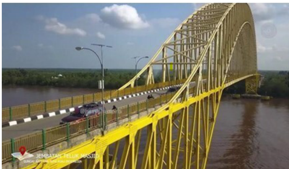
Figure 5. Bridge as an isolation opener