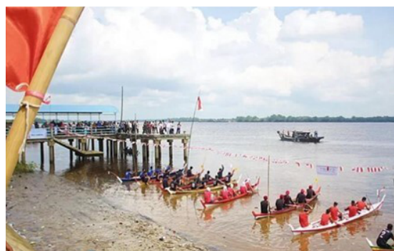
Figure 3. Boat racing as a cultural heritage

The adat system involves elders and community leaders who mediate disputes, oversee natural resource management, and maintain traditional practices (Endraswara, 2012), oversee natural resource management, and maintain traditional practices. Adat ceremonies are an important aspect of life in Sungai Apit, with traditional rituals, festivals, and events strengthening community ties. These cultural practices provide a framework for resolving conflicts, organizing agricultural work, and guiding social life in the community. The role of elders in the adat community is crucial; they are seen as repositories of cultural knowledge and wisdom, which maintain the continuity of traditions and practices. Elders often guide the younger generation in understanding and practicing customary law, which fosters a sense of heritage and identity.