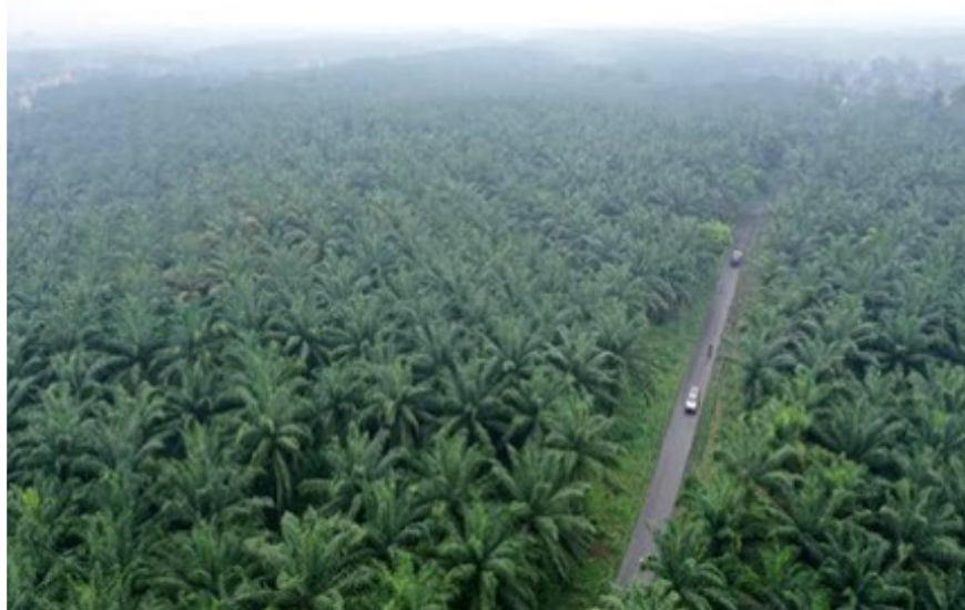
Figure 4. Palm oil becomes a leading economy

The majority of the population in Sungai Apit works in agriculture, particularly oil palm, rubber, and coconut. Many people work as smallholder farmers, while others work on large plantations or processing facilities for oil palm and rubber.