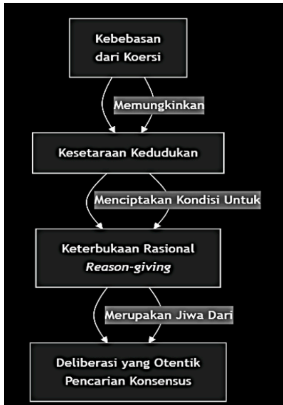
Figure 1. Habermas's Deliberative Democracy