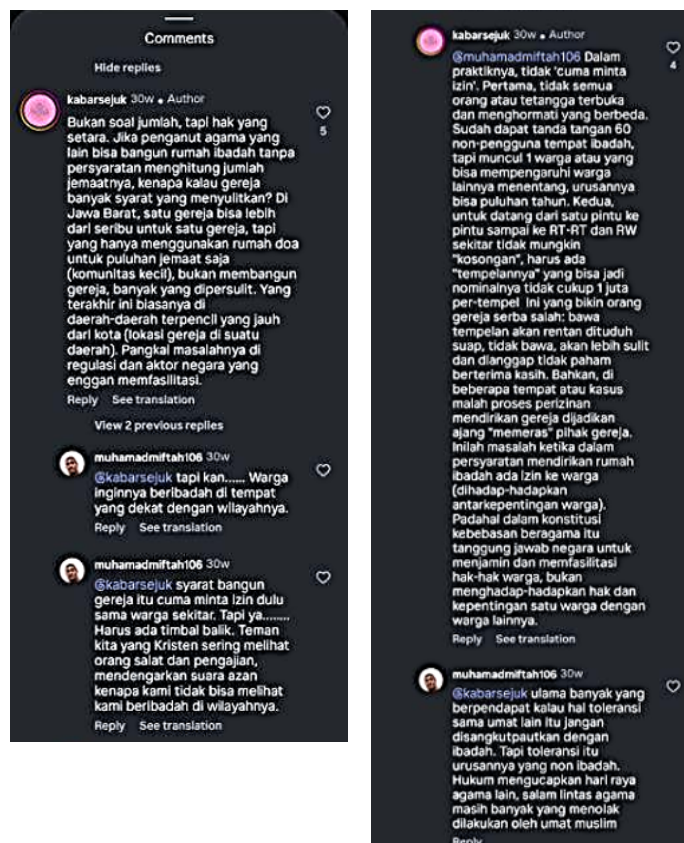
Figure 2. Commentar collum discussion

Even though the social media debate isn't rational ( debat kusir ), sometimes YIPC also found the rational debate argument. The author found a discussion in the comments column of an Instagram post from YIPC @yip.center on April 17, 2024, where there was a discussion from the accounts @kabarsejuk and @muhamadmiftah106 about building permits for houses of worship, especially churches.